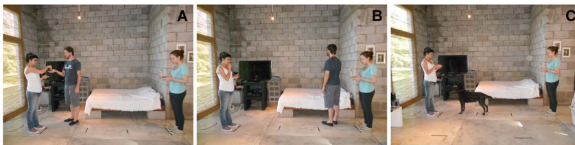
Figure 1. Photos of the experimental set and procedure. (A) The beggar receives food from the positive donor. (B) The beggar turns his back to the negative donor after having rejected the food. (C) The dog chooses the positive donor after the beggar left the room. All persons that appear in this figure have given written informed consent, as outlined in the PLOS consent form, to publication of their photograph. doi:10.1371/journal.pone.0079198.g001

All video recordings of sessions were watched by two independent observers: the last author, MB, and an assistant. The assistant only watched the choice period of sessions but not the interactions between the beggar and the donors (i.e., the demonstrations), meaning that she was unaware of who the positive and the negative donors were on a particular session. Inter-observer reliability was 100% for the choice measure, and