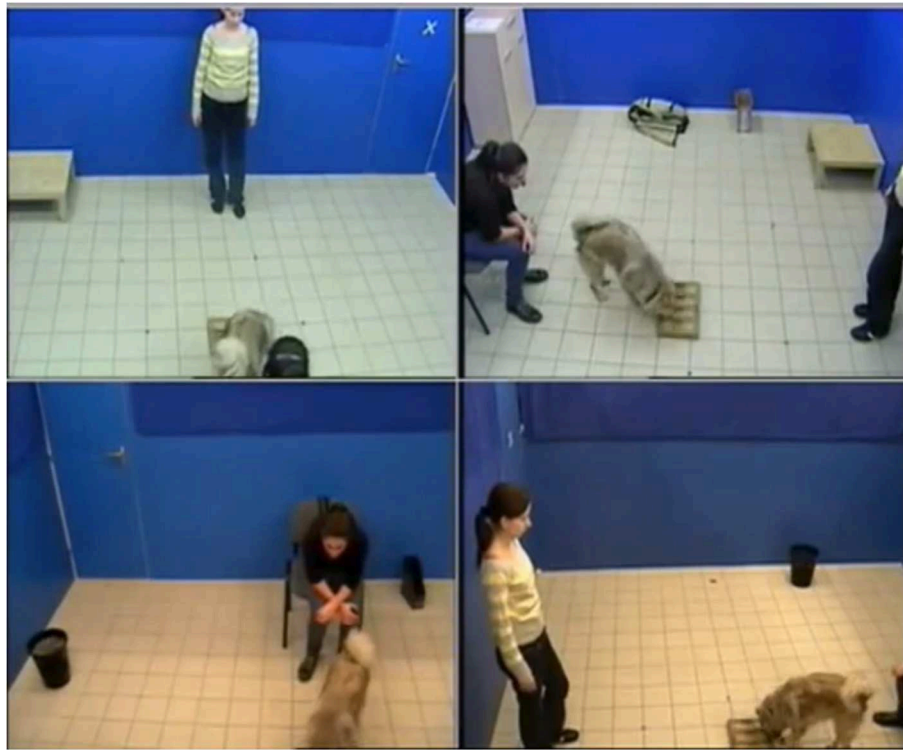
FIGURE 1 | The experimental setup. Written informed consents were obtained from the individuals for the publication of this image.

could not touch the apparatus nor the dog ( Figure 1 ). After the 2 min had elapsed, the experimenter put the toy back in the drawer. Dogs were allowed to eat only the food pellets they had recovered.