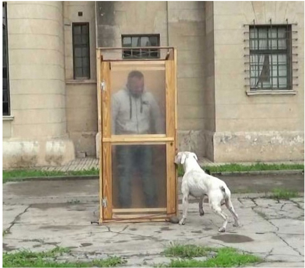
Fig. 1 Experimental setup (stressed owner condition). The owner is inside the apparatus calling for help, while his dog is in proximity and in contact with the box

solution according to the treatment assigned to them. One experimenter (E1) applied two puffs of spray (OT or saline) in each nostril while the owner was present and held the dog if needed. The other experimenter (E2) and the owner were blind to the treatment the dog received. This was done 40 min before behavioral testing. This interval is the time OT takes to reach central levels (MacDonald et al. 2011; Quintana et al. 2015) and has been frequently used in prior literature (for a review, Kis et al. 2017a).